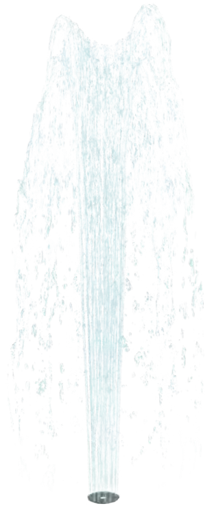
See Specification Sheet for product data.

Cluster ground sprays together to create exciting water experiences for users of all abilities. Ground sprays are a perfect addition to any play zone and create natural gathering areas for exploration and communal play.