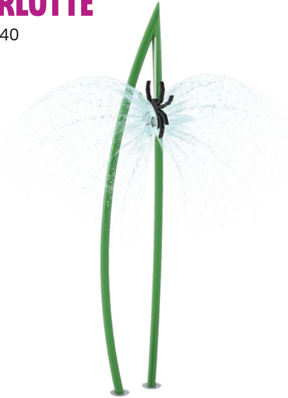
See Specification Sheet for product data.