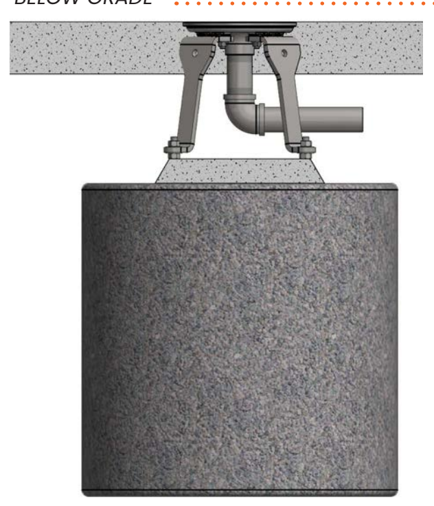
playPHASE™ (threaded female of